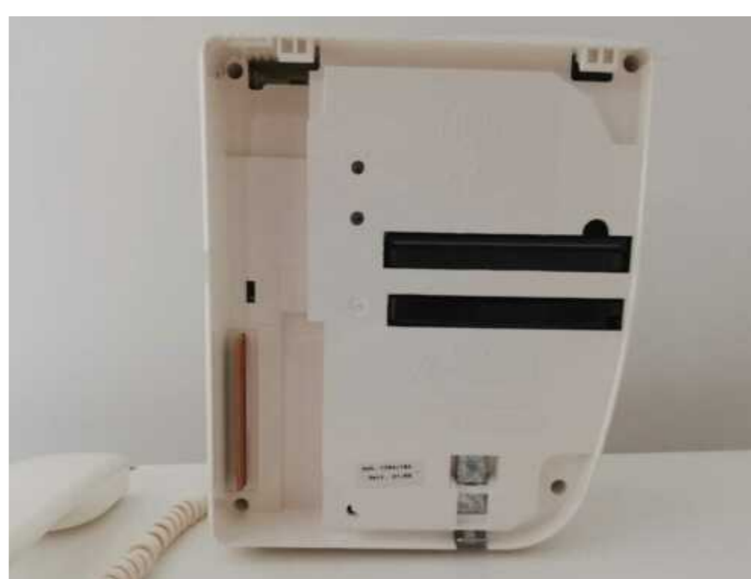
15 Installation Manual Urmet Domus